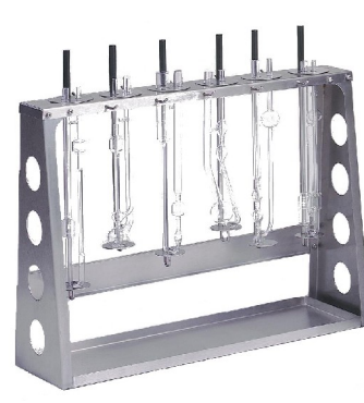
Viscometer Bench Stand Part No. 20430