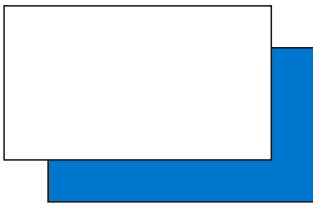
White or Blue